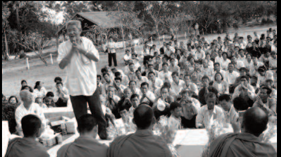
Khmer Rouge Victims at the Genocide Memorial site

Remembering the Victims of Democratic Kampuchea: DC-Cam also plans to compile and publish a book of names of all those known to have died under the Khmer Rouge regime. The compendium will be based on our research and will tangibly recognize and remember those who perished. To date, there are more than a million names in our