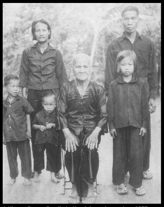
A Khmer Rouge Family in Kandal province, circa 1975 .

Between 2009 and 2011. the Documentation Center of Cambodia (DC-Cam) will continue pursuing its long-standing misison of promoting memory, justice, and reconciliation. We will compile further evidence of genocide and crimes against humanity and educate Cambodians on the historical facts regarding the Khmer Rouge regime. Our work will focus on the needs of ordinary Cambodian people—victims and their descendants—who are the keys to the country's past, present, and future. In addition to honoring those who died during the Khmer Rouge regime, it is crucial to reach out to and support living Cambodians in the country and around the world. This summary Strategic Plan outlines our plans to create enduring mechanisms that help overcome the shadows of Khmer Rouge terror and build a brighter future in Cambodia.