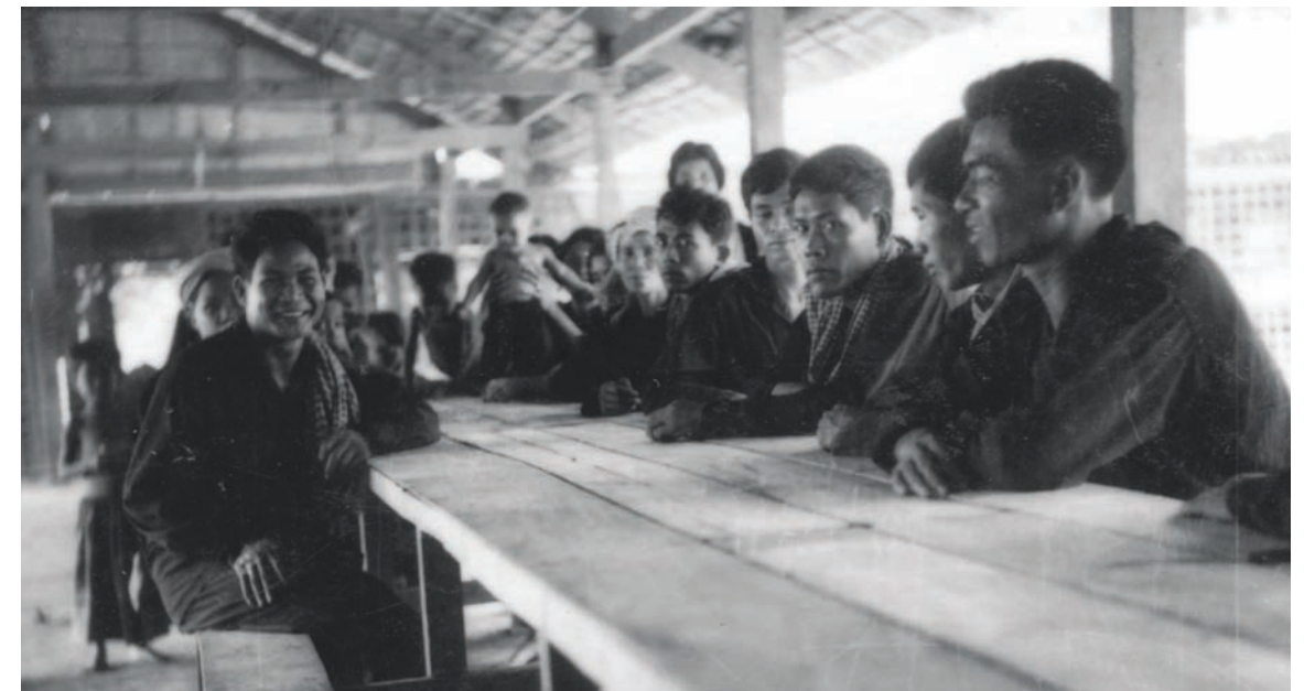
Khmer Rouge cadres at a communal hall.

People charged with lesser offenses and imprisoned at a lower level usually suffered from malnutrition,