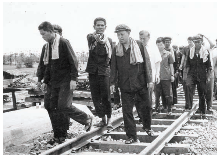
DK leaders with a foreign delegation.