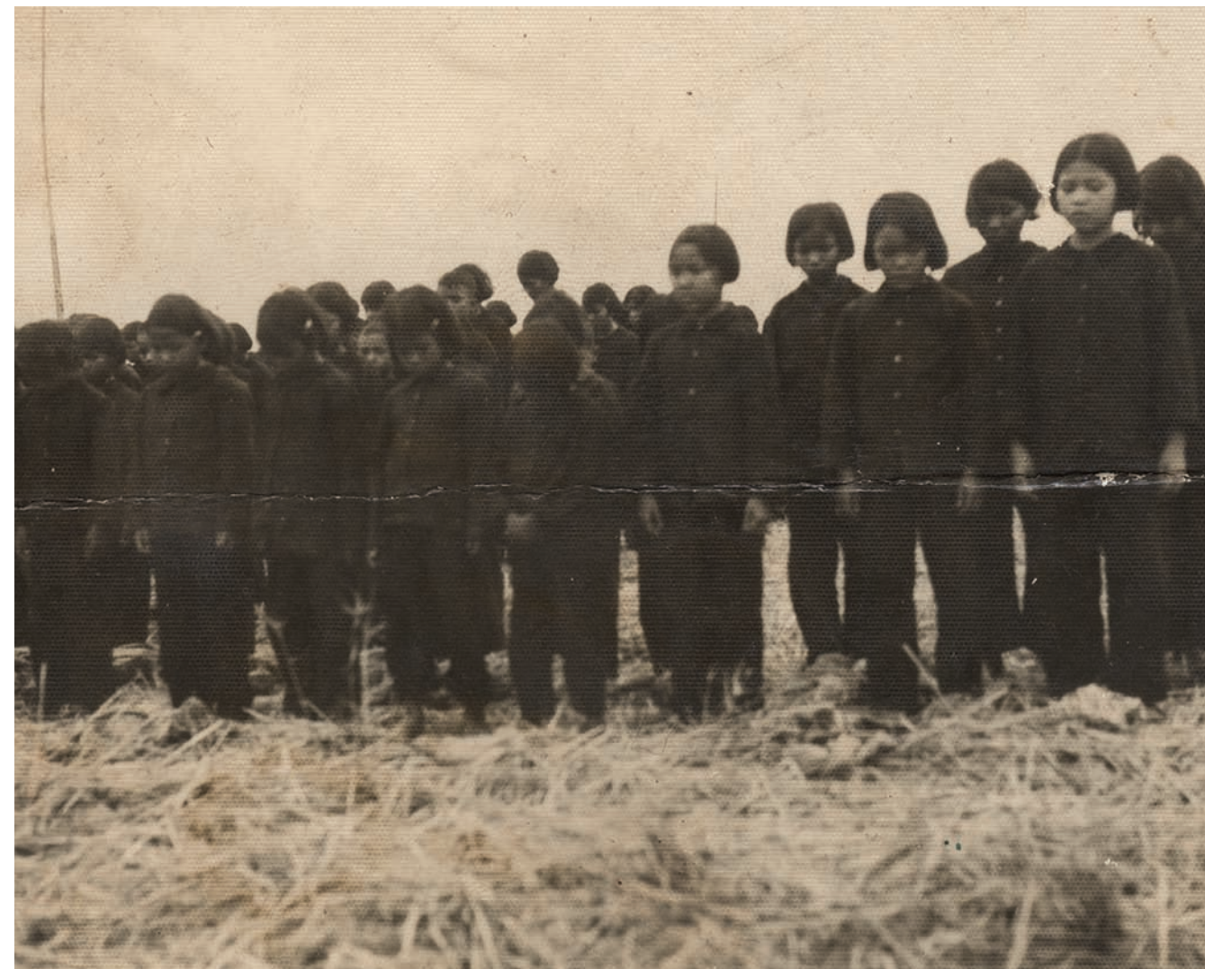
Children mobile unit.