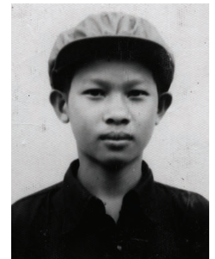
A Tuol Sleng messenger.

Minority groups: To carry out their revolution, the Khmer Rouge favored ethnic Khmers who had no links to the former government. All minority peoples, who were not considered trustworthy and were suspected by Angkar, were persecuted.