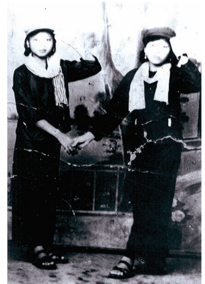
Two Cham muslim cadres posted in a local photo studio in the Khmer Rouge liberated zone, Kratie Province.

On December 3, 1978, Radio Hanoi announced the establishment of the United Front for the National Salvation of Kampuchea. 25 The Front was led by Comrade Heng Samrin, who had fled to Vietnam in late 1978.