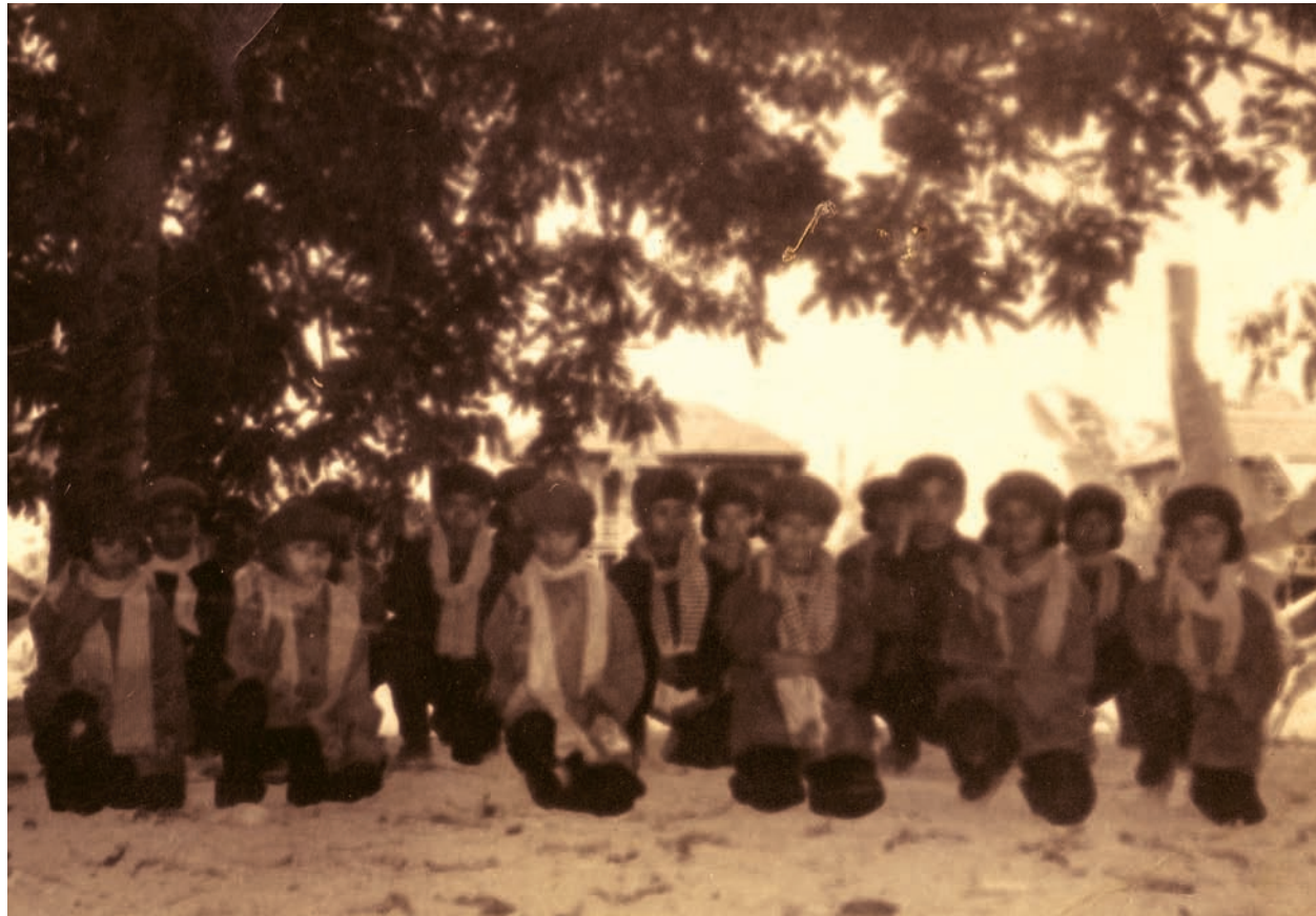
Children unit.

supervision. The senior leaders seemed to believe what their subordinates reported to them, while the cadres were terrified to report any bad news. CPK officials believed that the party never made mistakes and could never be wrong. All bad things were the fault of foreigners or traitors. As living conditions grew worse during the regime, hundreds of thousands died from overwork and malnutrition.