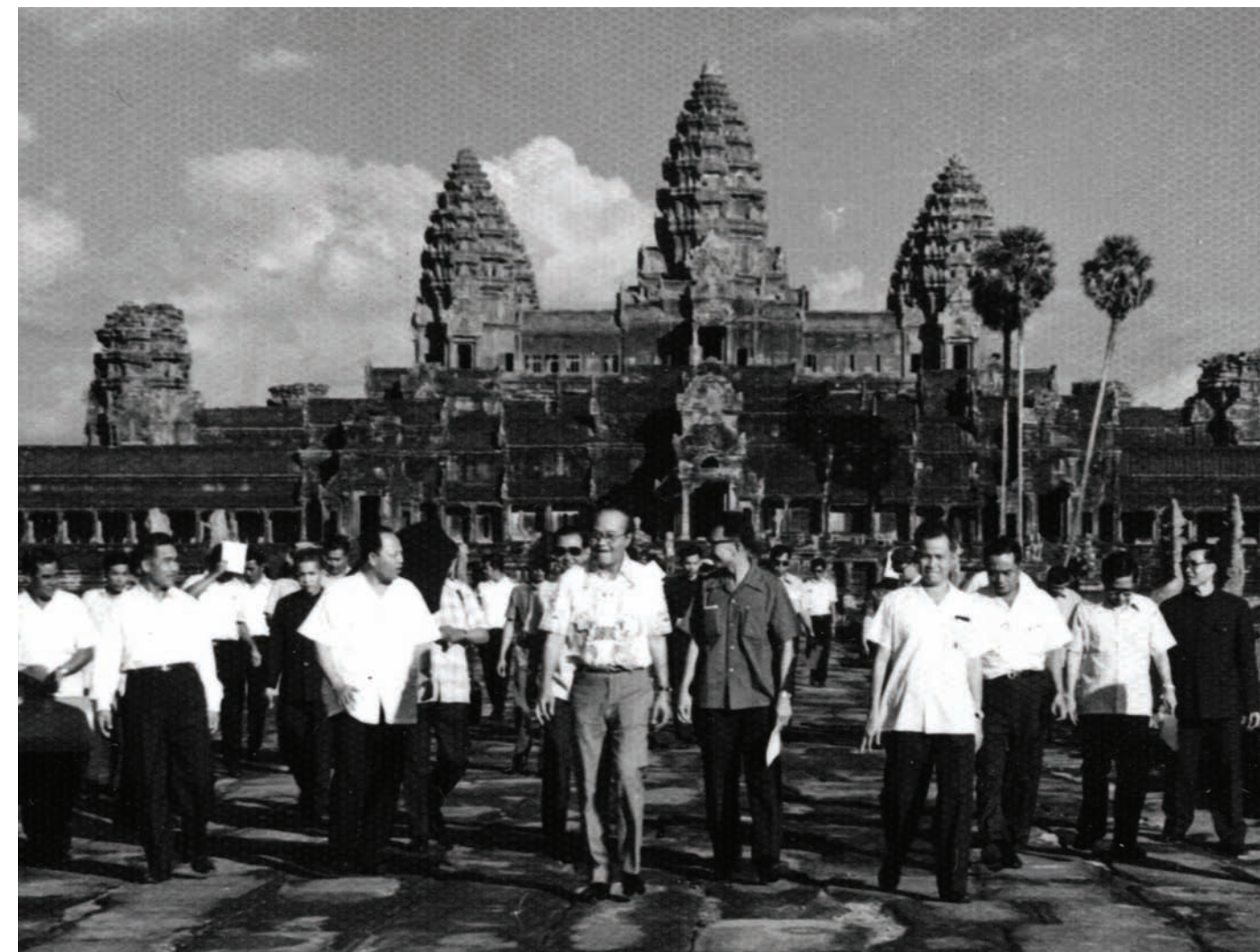
DK leaders with a foreign delegation.