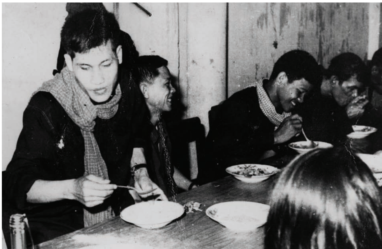
Khmer Rouge prison staff eating together.

each other. Vann Nath, one of the few S-21 survivors, described his life in S-21: