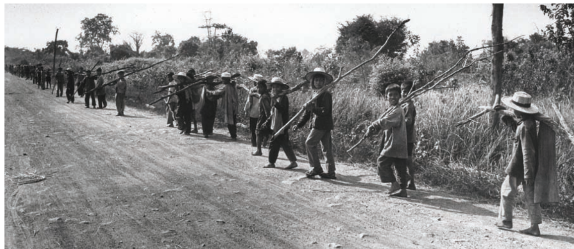
Children unit.

My 7-year-old sister was killed by Angkar because she stole one ear of corn to eat. She was hit with a hoe and buried near the corn farm. One afternoon, while I was walking the cows across the forest, I smelled a rotting corpse. I searched for it to see if I knew the dead. There I found the body of my father, with his neck nearly cut off from his shoulders. There were two other bodies lying dead of the same cause. Two months later, my 70-year-old grandmother died; she was accused of stealing rice porridge from children and was clubbed to death. Her body was wrapped in a sack and buried. Several days later, my mother died of overwork and malnutrition. I hugged her with a heartbreaking cry. 20