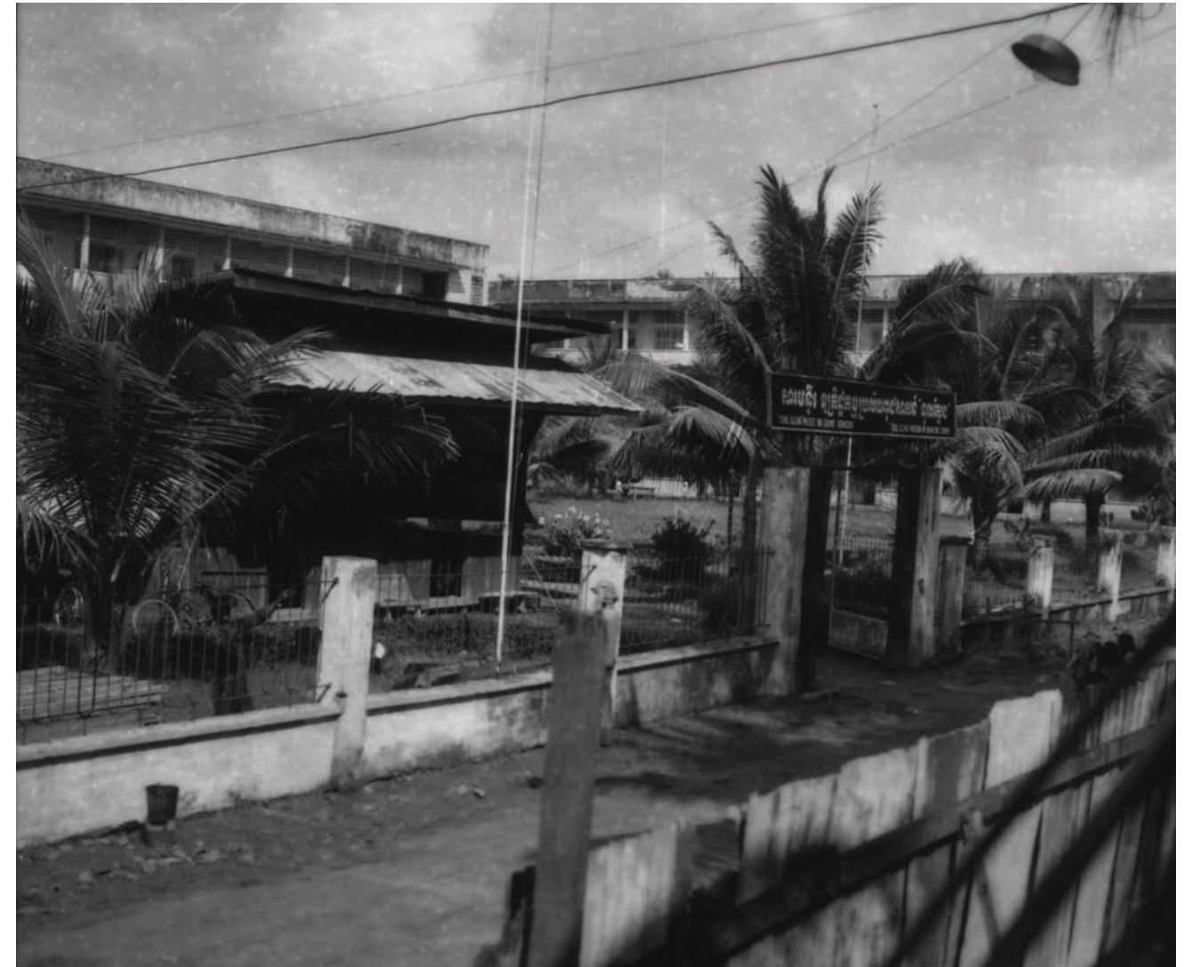
Tuol Sleng compound.