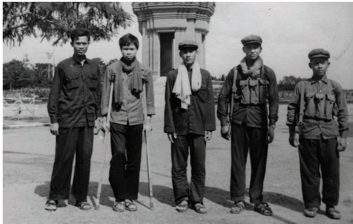
Khmer Rouge soldiers at the Independence Monument. (Documentation Center of Cambodia Archives)

Cham Muslims. The Khmer Rouge forced Cham people to flee their villages and live dispersed among Khmers. They were forbidden to speak their language or to practice Islam. The Khmer Rouge killed many of their leaders ( hakims ) and anyone else suspected of resisting government policies.