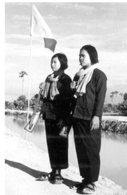
Khmer Rouge cadres.