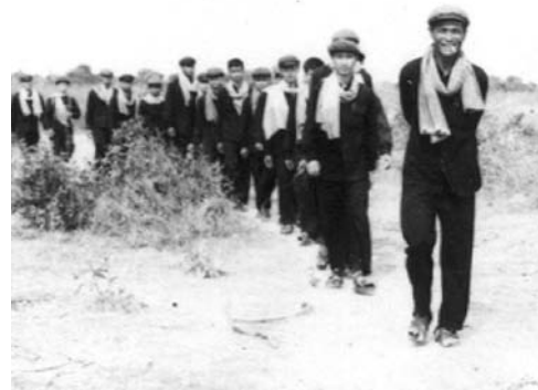
Khmer Rouge cadres returning from field works

ic states like the Soviet Union, Vietnam and their allies. Most of the people considered external enemies were falsely accused of working for the US CIA, the Russian KGB, or the Vietnamese. The Khmer Rouge also considered Cambodians who could speak a foreign language to be spies for foreign countries. This accusation became a convenient excuse to execute people who local authorities did not like.