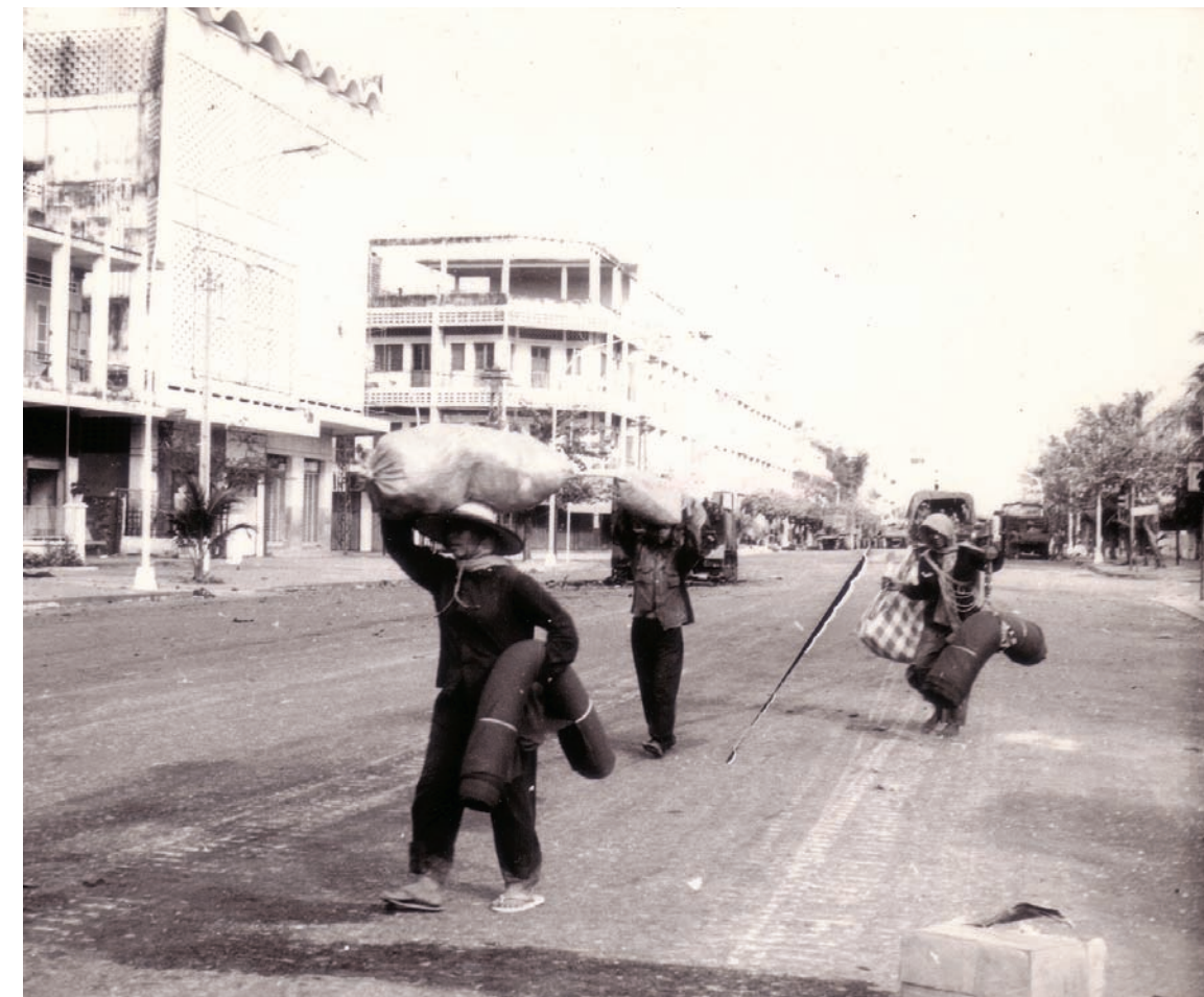
The return home of survivors after the fall of the Khmer Rouge in January 1979.

In August 1996, Ieng Sary defected to the Royal Government of Cambodia, bringing some Khmer Rouge units with him. Other senior Khmer Rouge leaders, such as Ke Pauk, Nuon Chea and Khieu Samphan, defected in 1998. After Pol Pot died in 1998, Ta Mok was the only surviving leader who refused to join the Royal Government of Cambodia; he was captured in March 1999. By then all the surviving Khmer Rouge leaders had surrendered or had been arrested, and the movement totally collapsed. People living in the Khmer Rouge-controlled areas repatriated and reunited with the Royal Government of Cambodia.