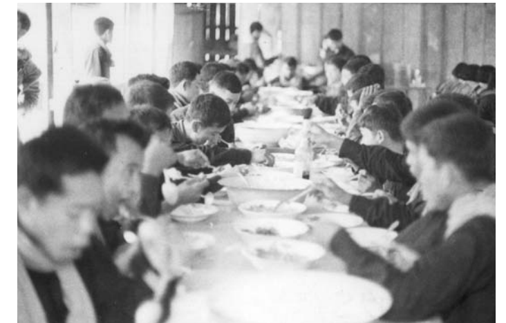
Communal eating in dining hall.

Ethnic Chinese. The members of this community, who were often entrepreneurs, also joined the forced march to the countryside to take up agricultural work. They were treated harshly when they failed to work hard, but they were not singled out to be killed.