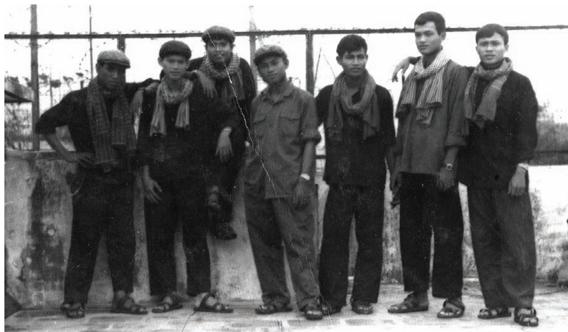
Khmer Rouge cadres.

Tuol Sleng prison was made into a genocide museum and Choeung Ek into a memorial by the government of the People’s Republic of Kampuchea with assistance from Vietnam in 1979.