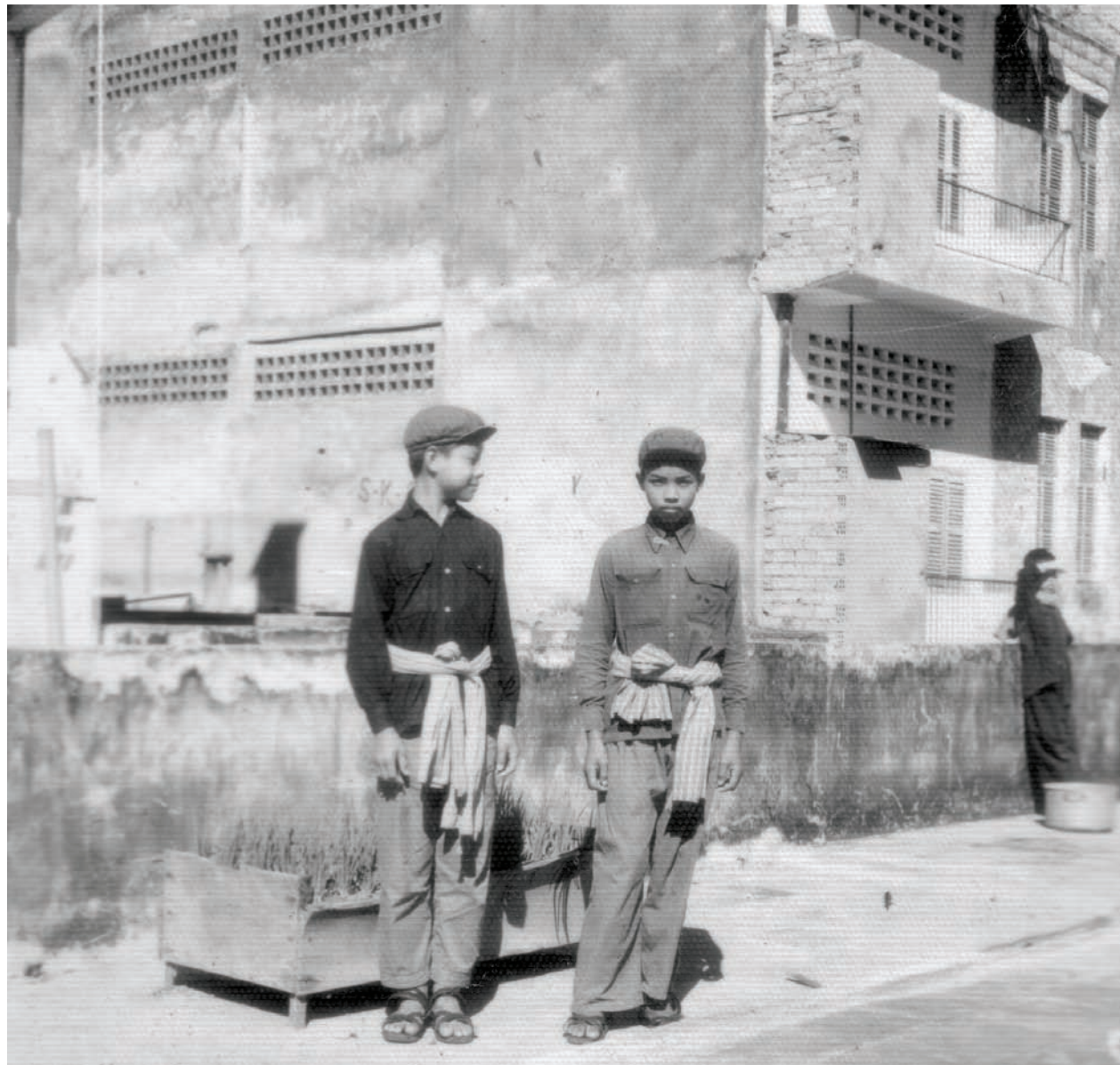
Khmer Rouge child cadres.