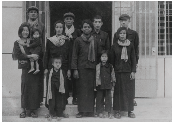
Khmer Rouge prison staff and family of S-21.

Most of the prisoners at S-21 were accused of betraying the party or revolution, or of working for traitorous cadres who had already been arrested. With the passage of time, the CPK leaders became increasingly suspicious and distrusted their own cadres and soldiers. In October 1976, for example, Pol Pot had several high-ranking CPK members arrested and imprisoned in S-21 in a move to tighten national security. The Khmer Rouge leadership saw enemies in every corner of the country and arrested hundreds of fellow communists each month. The prison population also included approximately 400 members of many other nationalities, mostly Vietnamese.