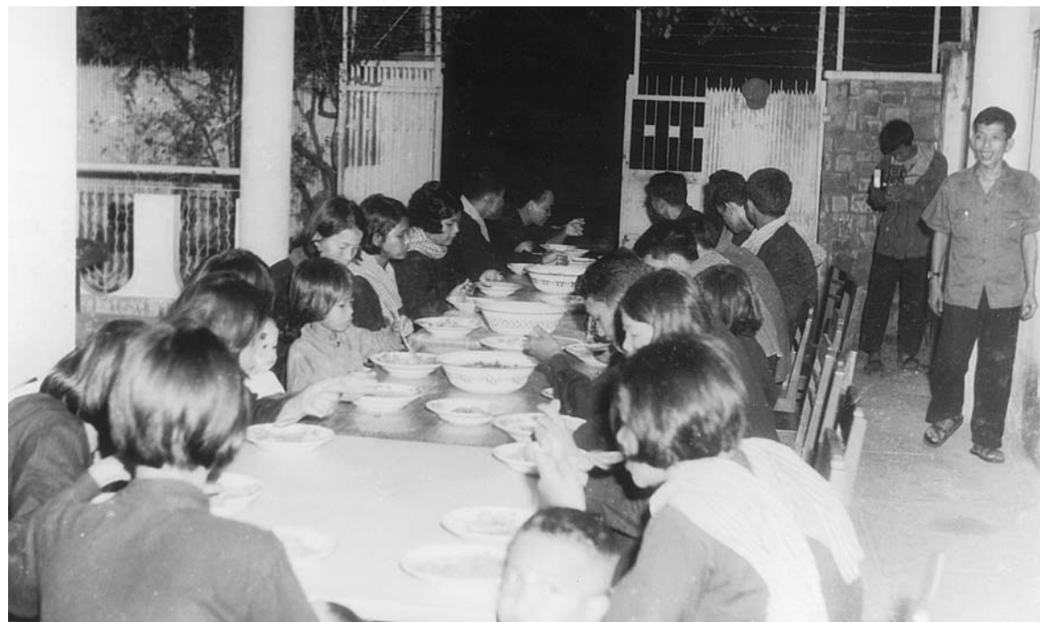
Tuol Sleng prison staff eating communally.

Over a thousand people worked in and for S-21. Several hundred of them were general workers, including