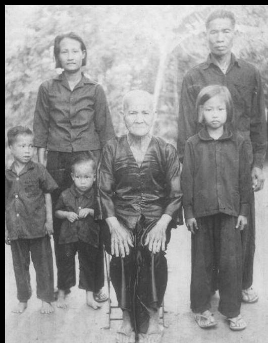
A Khmer Rouge Family in Kandal province, circa 1975 .

Between 2009 and 2011, the Documentation Center of Cambodia (DC-Cam) will continue pursuing its long-standing mission of promoting memory, justice, and reconciliation. We will compile further evidence of genocide and crimes against humanity and educate Cambodians on the historical facts regarding the Khmer Rouge regime. Our work will focus on the needs of ordinary Cambodian people—victims and their descendants—who are the keys to the country's past, present, and future. In addition to honoring those who died during the Khmer Rouge regime, it is crucial to reach out to and support living Cambodians in the country and around the world. This summary Strategic Plan outlines our plans to create enduring mechanisms that help overcome the shadows of Khmer Rouge terror and build a brighter future in Cambodia.