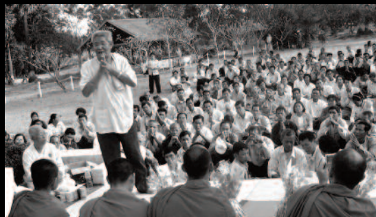
Khmer Rouge Victims at the Genocide Memorial site

Remembering the Victims of Democratic Kampuchea: DC-Cam also plans to compile and publish a book of names of all those known to have died under the Khmer Rouge regime. The compendium will be based on our research and will tangibly recognize and remember those who perished. To date, there are more than a million names in our