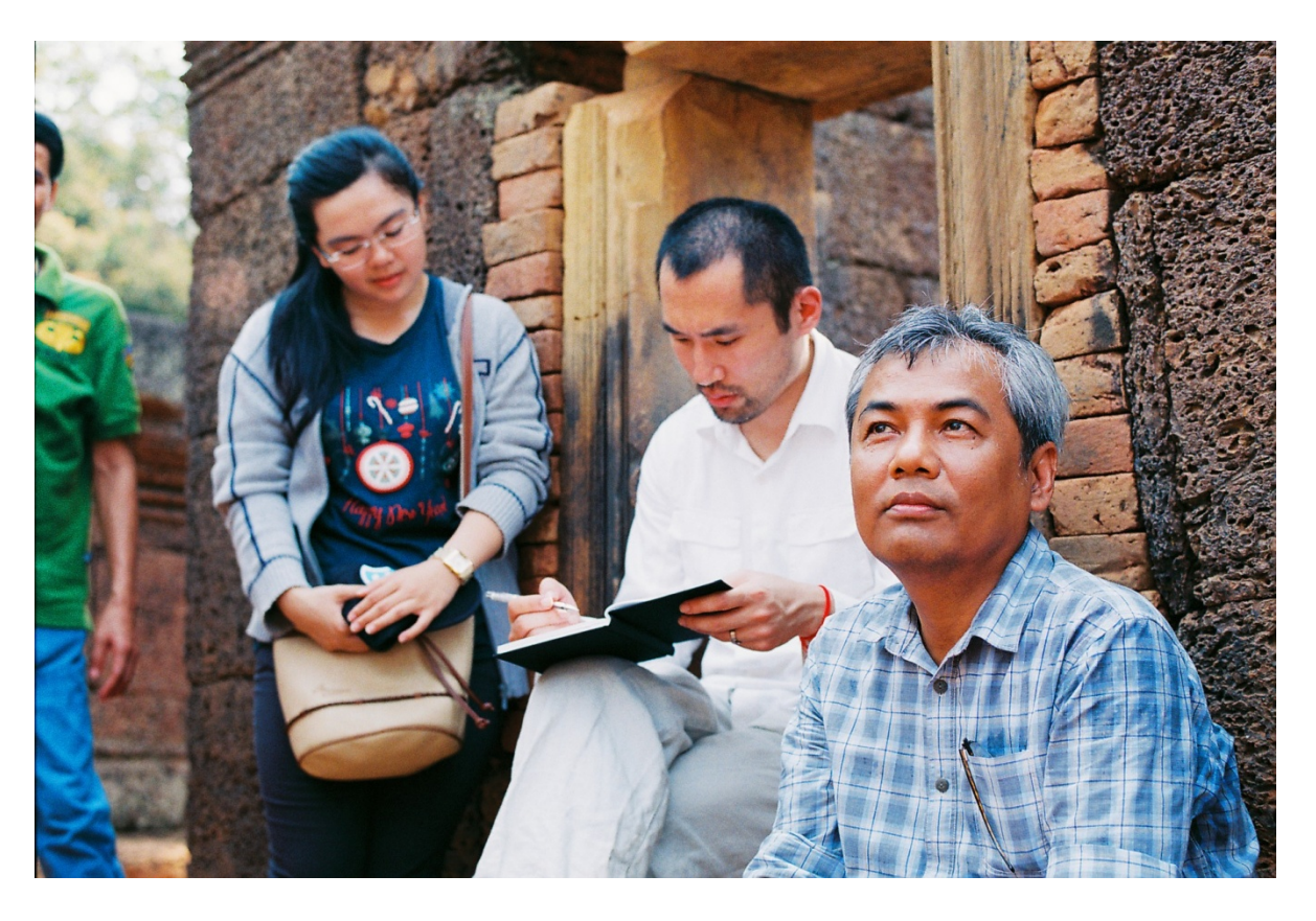
Appendix B: Photos of Burmese monks, nuns, and NGO staff during their visit March 19-22, 2014