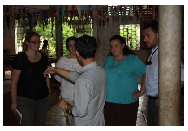
DRL Delegation in the field, 20 November 2013

On November 20<sup>th</sup>, a PVF was held in Koas Kralah Commune, Koas Kralah District, Battambang Province. It has involved 60 students (30 female) from Koas Kralah High School and 45 villagers (25 female) and teachers. The forum turned its attention to the historical facts related to the forced transfer of the population called 'Easterners' or 'Blue Scarf People' which was a consequence of the deep distrust among the KR echelons. It also touched upon whether the brutal treatments and executions could