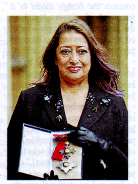
Architect Zaha Hadid