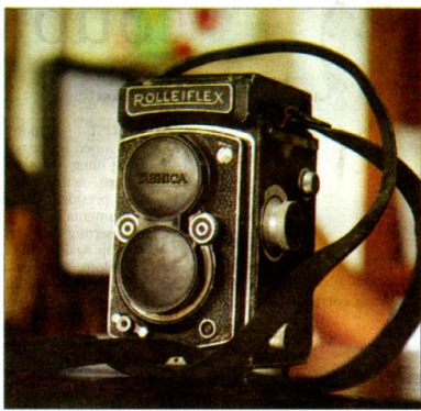
The Rolleiflex camera that was used to photograph victims of the Tuol Sleng detention centre displayed at the Documentation Center of Cambodia in Phnom Penh yesterday.

"This camera was kept by my father until 1996 when he had to travel to the US for heart surgery. I just kept it in a