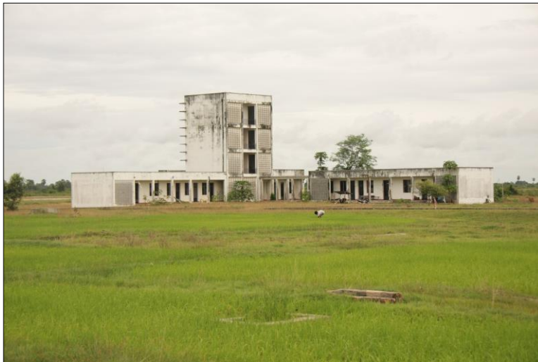
Control tower at incomplete Kampong Chhnang airport