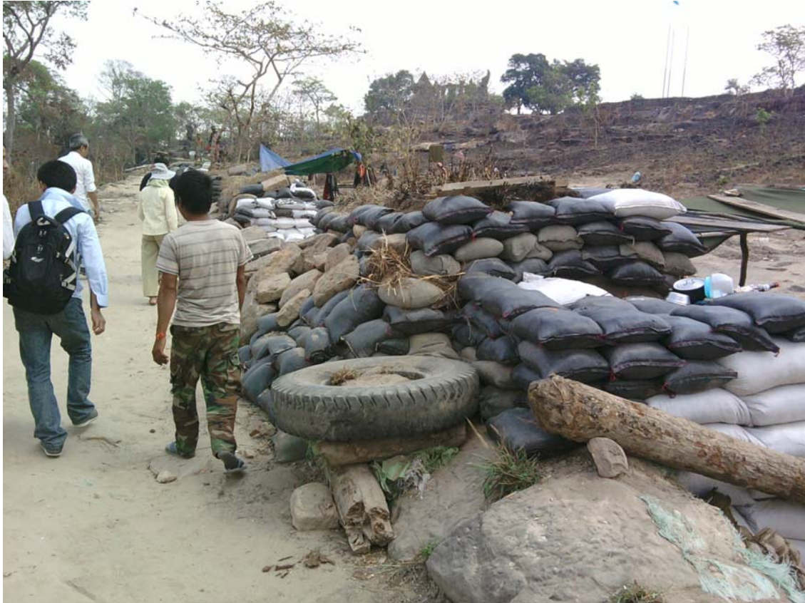
“Preah Vihear and Pra Viharn Conference: Pathways to a Shared Destiny” March 21, 2013

The Chumbhot-Pantip Conference Room Faculty of Political Sciences, Chulalongkorn University