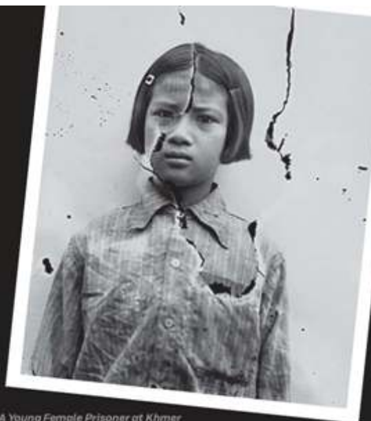
A Young Female Prisoner at Khmer Rouge Prison, 5-21

Our curriculum and training program revolve around DC-Cam's history textbook The History of Democratic Kampuchea . Our textbook has received plaudits from around the country and the world. It is the first of its kind, educating Cambodian youth about the Khmer Rouge tragedy after three decades of relative silence on the subject in Cambodia's schools. The book has been praised for its sensitive, yet candid depiction of DK history balancing intimate portrayals of horrific crimes with a solemn respect for the dignity of victims. Maintaining this balance between truth and sensitivity is an important quality of DC-Cam's education program, which aims to not only educate but also remember. Genocide education must serve the public need for knowledge about this time period but it must also do so in a manner that respects and empowers victims. In this