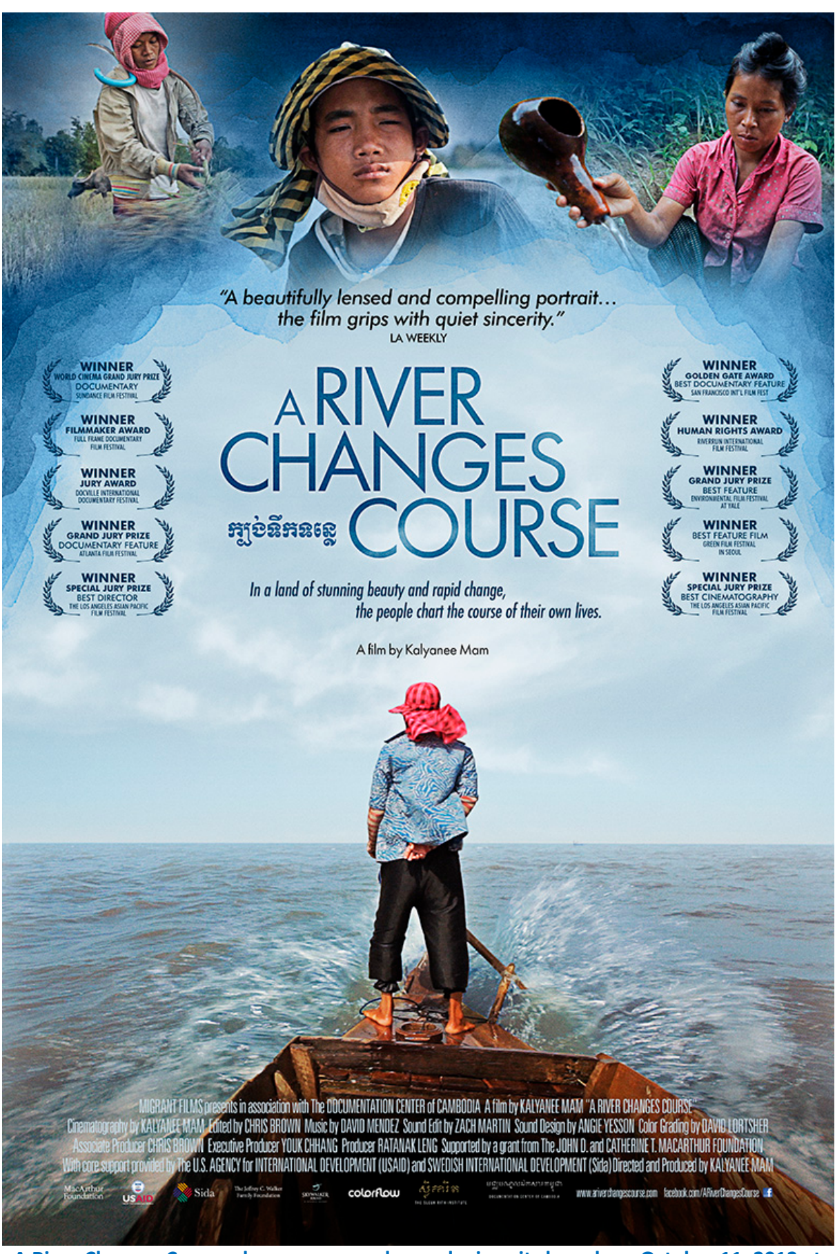
A River Changes Courses has won several awards since its launch on October 11, 2013 at Phnom Penh Cultural Center.