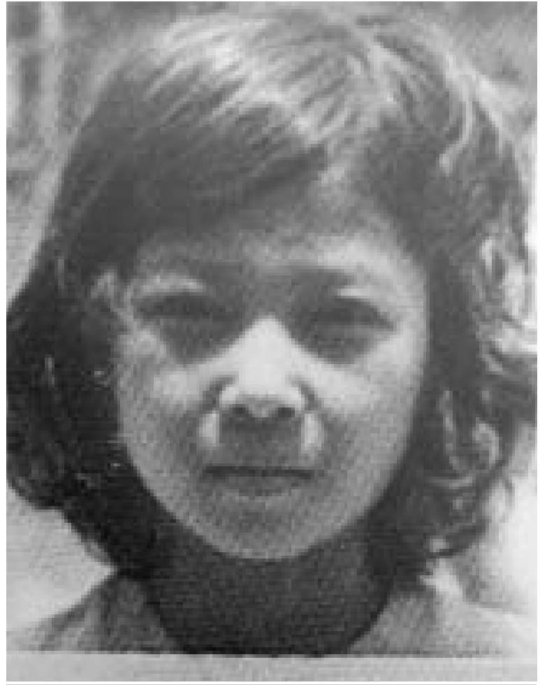
First They Killed My Father: A Daughter of Cambodia Remembers