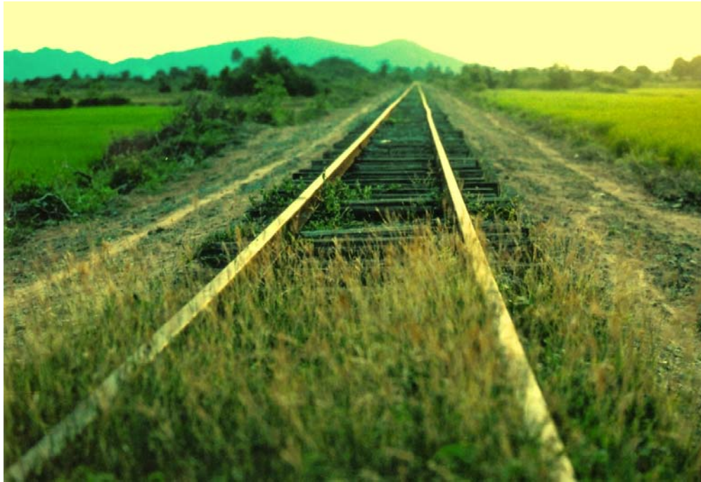
Railroad track where three foreigners were captured by the Khmer Rouge forces in 1994.

Screenings held in cooperation with the Ministry of Interior and funded by U.S. Department of State Bureau of Democracy, Human Rights and Labor (DRL) with the core support from USAID and Sweden. OSI, Denmark, Australia and Norway provided the screening materials.