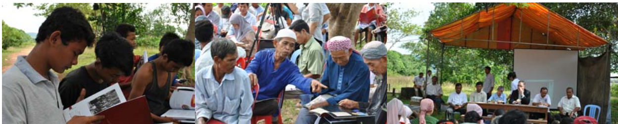
Participants at the Forum.

Although it is not possible to bring everyone to justice, those most responsible and senior leaders were being prosecuted, and this honors victim's memories. He encouraged audience questions, noting that, as the prosecutor's office represents society, they want to know the public's views so they can take them into account.