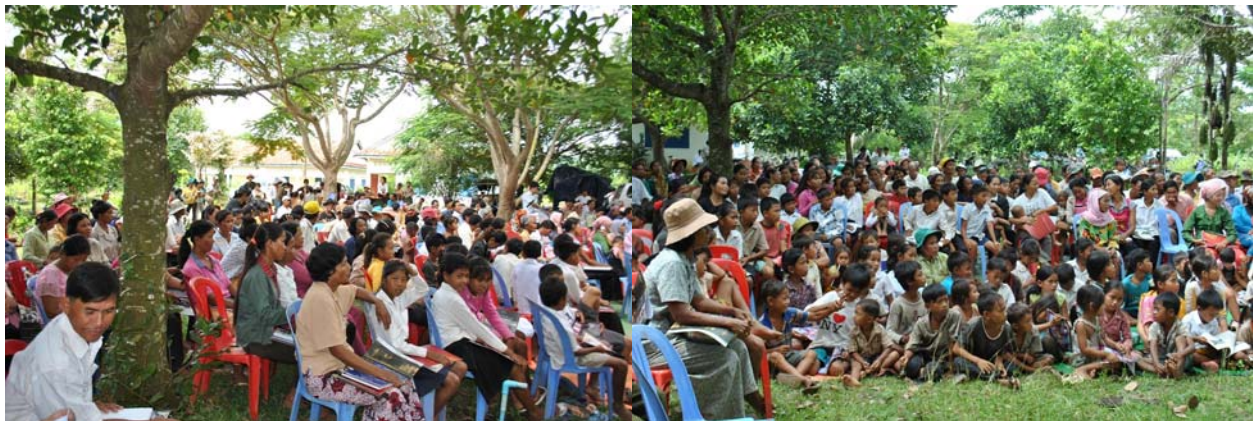
Participants at the Forum.

Regarding the Duch verdict, one man said that he hoped the ECCC can find justice for all Cambodians. He was against the reduction of the 35-year sentence to 19 years. Thirty-five would be okay because Duch would be more than 100 years at the end of it, but with the reduction he might get out of prison. To his mind, the ECCC must have followed rules in deriving 19 years. So, though he wants a longer sentence, he supports