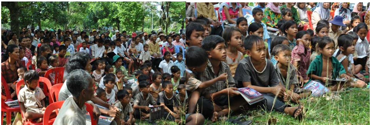
Participants at the Forum.