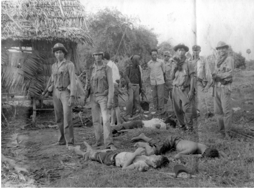
Government's (PRK) soldiers attacked and killed several Khmer Rouge at Phnom Voar in 1983.