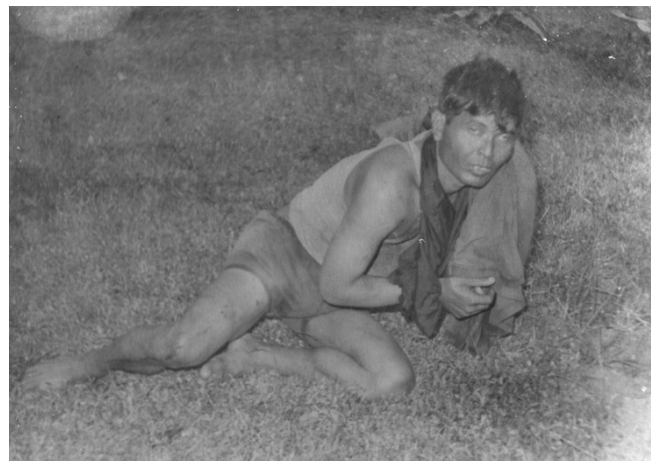
A Khmer Rouge was captured by the Government in 1983.

For their roles in the killing, three Khmer Rouge cadres were sentenced to life imprisonment, despite the fact that at least two of them were eligible for a general amnesty from prosecution for having defected to the government shortly after the attack. General Nuon Paet, the commander of KR Division 405