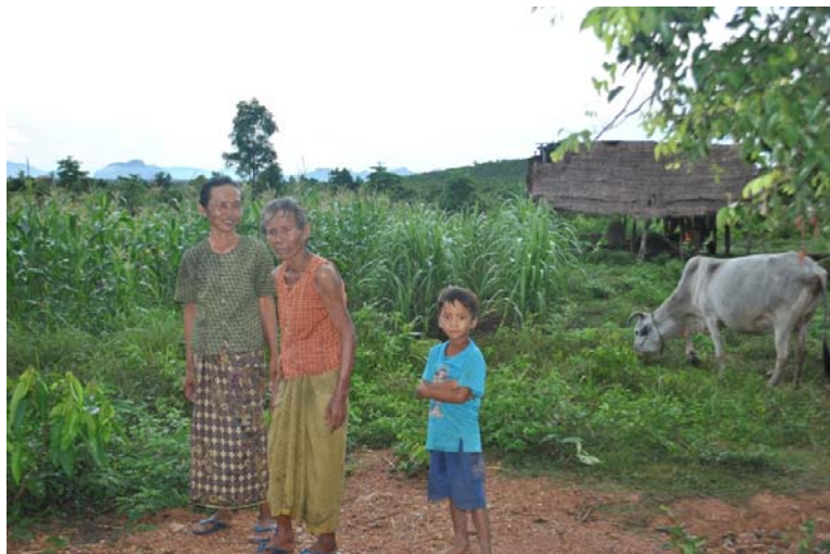
Villagers standing in front of their house located in Chamkar Bei village (Phnom Voar area)

Today, the Phnom Voar area is sparsely populated, with many fields lying fallow despite it being planting season. The train tracks where the three backpackers were kidnapped are in close proximity to the village, a constant reminder of those crimes and their impact on the community. In addition to former Khmer Rouge cadre who settled here, new people, including KR victims, have moved to the area. Although the commune is only 20 minutes from the popular resort town of Kep City, many families have been unable to make a living from farming and small business and have moved away in the last few years. More intend to leave soon.