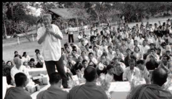
Khmer Rouge Victims at the Genocide Memorial site

Remembering the Victims of Democratic Kampuchea: DC-Cam also plans to compile and publish a book of names of all those known to have died under the Khmer Rouge regime. The compendium will be based on our research and will tangibly recognize and remember those who perished. To date, there are more than a million names in our