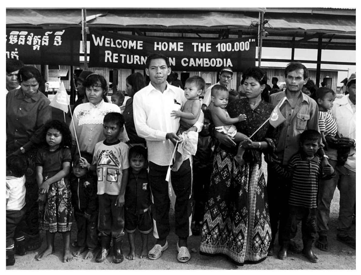
Welcome home of 100,000 refugee from camps in Thailand. August 28, 1992, Phnom Penh Cambodia