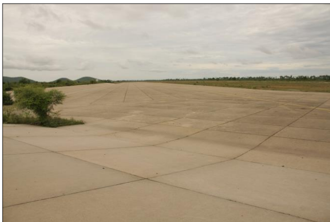
Runway at Kampong Chhnang airport

In 1977, the government of Democratic Kampuchea decided to establish an airport in Kampong Chhnang province with financial and technical support from the government of China. During the construction process, the Ministry of Defense and Headquarters of General Army empowered and authorized Division 502 to supervise the construction of the new airport. Some soldiers from this division were charged with treason and were sent to S-21 for confession, torture and execution.