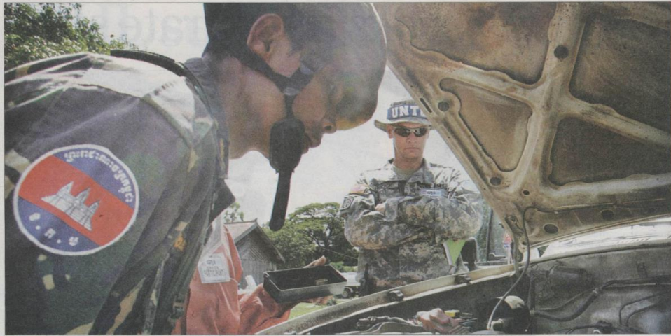
A US soldier serving under the United Nations Transitional Authority in Cambodia (UNTAC) watches a Royal Cambodian armed forces soldier as he examines a vehicle during an unexploded ordnance clearance course.