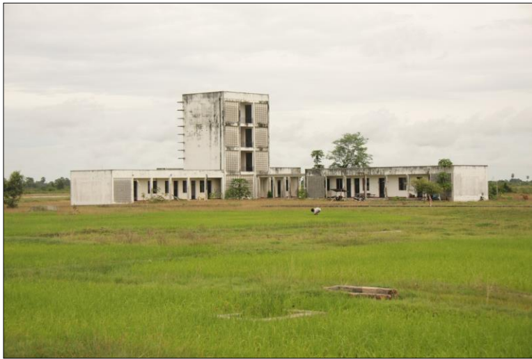
Control tower at incomplete Kampong Chhnang airport