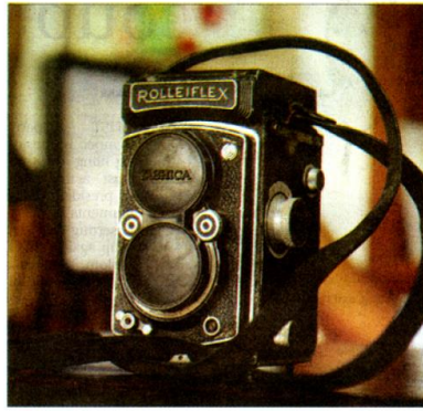
The Rolleiflex camera that was used to photograph victims of the Tuol Sleng detention centre displayed at the Documentation Center of Cambodia in Phnom Penh yesterday.

"This camera was kept by my father until 1996 when he had to travel to the US for heart surgery. I just kept it in a